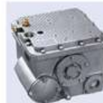
GP-50 Gear Pump