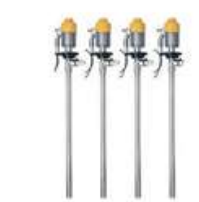
220V EX proof Barrel Pump 150l/pm