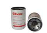
Filter with Housing