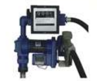
DC EXPLOSION PROOF Af Gas PUMP