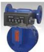
Positive Displacement Vane Meter