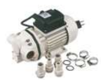
Ad Blue Pumps