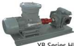
YB Series High Speed Transfer pumps 300I-1200I/PM