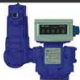
Flow Meter Positive Displace Meter Bulk Transfer Accuracy : ±0.2-0.5% Main Application : Fuel Oil Size : DN50-100