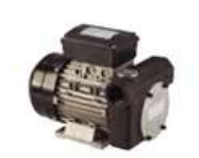
220v/ 24v / 12v Motrs