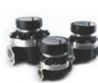
Mechanical Oval Gear Flowmeter