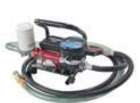
MFP Electronic Transfer Pump