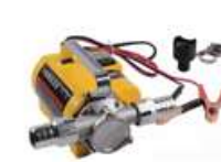
12v DC pump