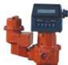
Volume Type Flow Meter Measuring Principle: Mechanics DN50-100 Sensor: Plug-in Type Accuracy: ±0.2-0.5%