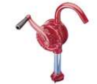
Rotary Hand Pump