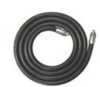
Hose with Swivels