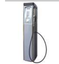
ELECTRONIC LUBRICATING DISPENSER