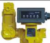
Positive Displacement Flow Meter Accuracy: \pm 0.2-0.5\% Main Application: Fuel Oil Size: DN50-100