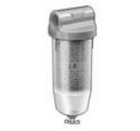
Water Trap Filter