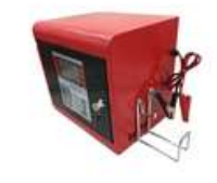
CUBE ELECTRONIC PUMP 12v/24v