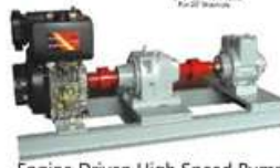
Engine Driven High Speed Pump 300-600L/PM