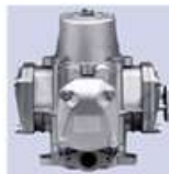
FM-500 Flow Meter