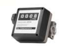
Mechanical Flowmeter 1% accuracy