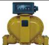
Bulk Transfer Flow Meter, Rotary Vane Positive Displacement Accuracy: \pm 0.2-0.5\% Size: DN100-500 Sensor: Plug-in