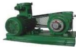
YB Series / Belt Driven High Speed Pump 300-900L/pm