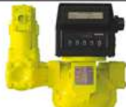
Positive Displacement Flow Meter/ ticket printer Accuracy: \pm 0.2-0.5\% Main Application: Fuel Oil Size: DN50-100