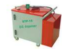
MOBILE LUBRICATING DISPENSER